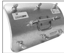
LRADUL - Round UL Door