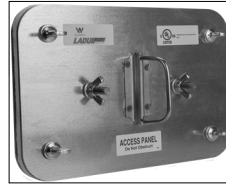
LADUL - Flat UL Door