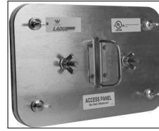
LADUL - Flat UL Door