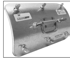
LRADUL - Round UL Door